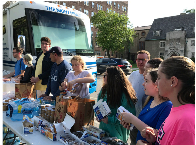
Distributing 150 hoagies, sides, and beverages from the Night Ministry bus on Chicago's South Side.