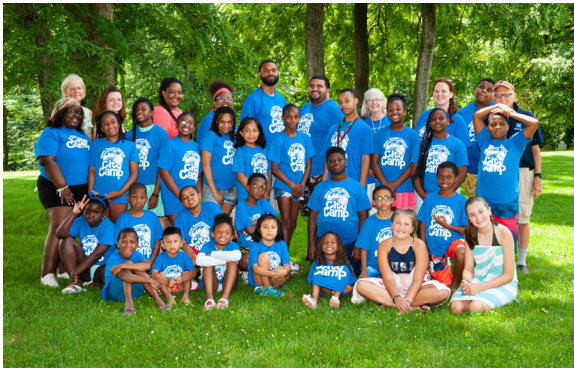
Time out for a Camp Get-Along photo op