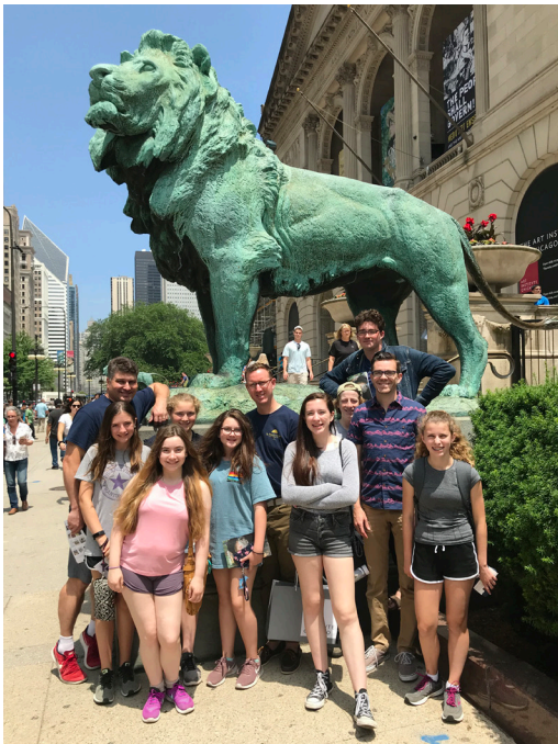
Getting in some sightseeing at the renowned Art Institute of Chicago on Saturday morning, before heading to the airport at the end of a rewarding week.