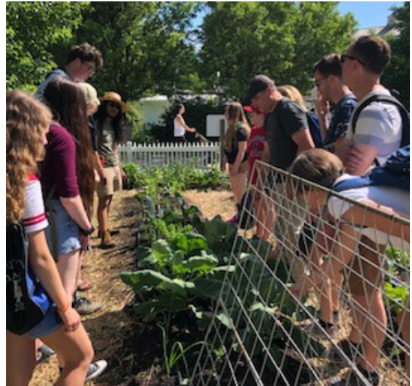
Learning about Edible Garden, a sizeable urban agriculture educational outreach project in Lincoln Park Zoo's Farm-in-the-Zoo. Some of the produce grown here is donated to the Lakeview food pantry where we volunteered.