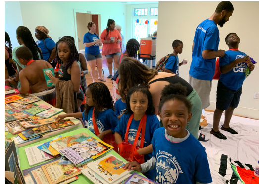
Thanks for the great lunch and great books!