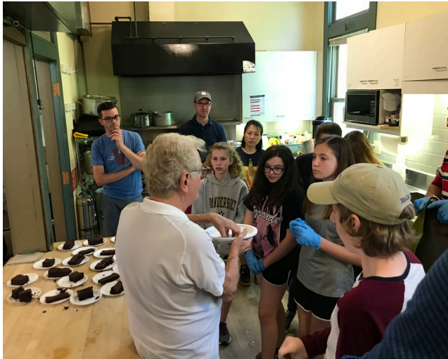
Helping prepare and serve lunch at the Episcopal Church of our Savior, near Lincoln Park which places high value on fostering community through its Circle of Friends program.