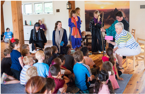
Telling stories of God's love at VBS