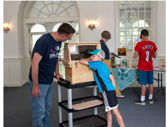
Exploring nature ... especially bees and hives